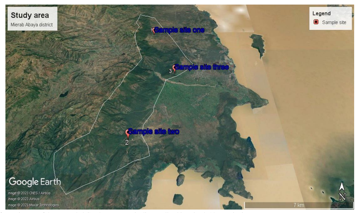
Figure 1. Map of three sampled Combrutem Terminalia woodland in Mierab Abaya District.

Mierab Abaya natural vegetation accounts for the major vegetation cover of the Wereda, which was designed to conserve long-lasted unique natural features, unique scenery, historical interests, and other natural values with legal and administrative supports on the upper part of Aribaminch town. The protected part of Mierab Abaya natural vegetation was considered as an important pillar for future local development and it is adjacent to Nechisar national park of protected natural vegetation.