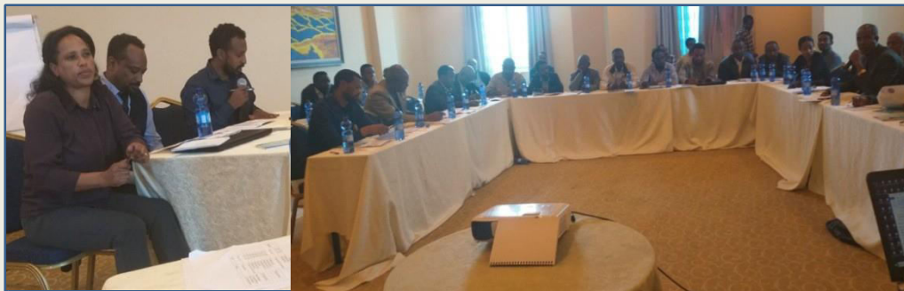
Figure 1: Establishment of the national Tree Seed Network, 24 May 2019, in the presence of stakeholders, Nexus hotel Addis Ababa

The overall objective of the Tree Seed Network is to facilitate adequate provision of quality tree seeds of required species to all parts of the country by developing effective tree seed systems and facilitating networking among seed producers and users ,thereby enhance implementation of CRGE strategy of the country.